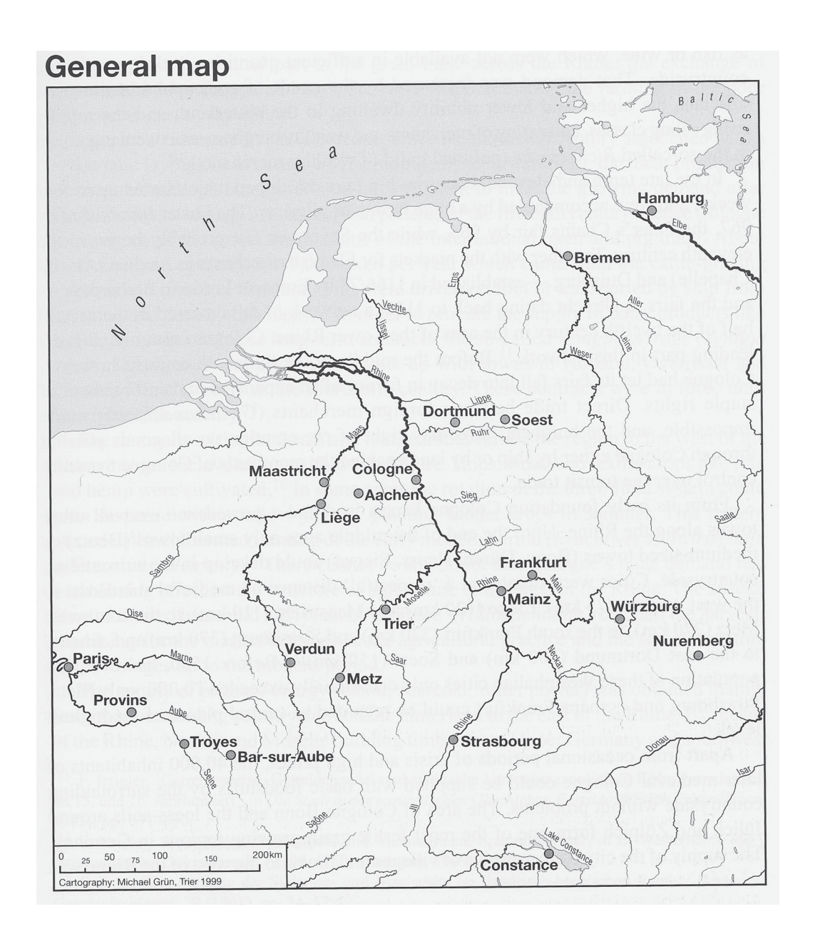
Fig. 3.1. Location map: places mentioned in the text