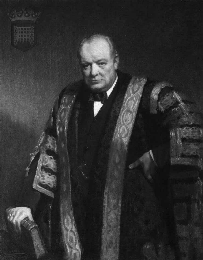
Figure 16. Churchill in his Chancellor's robes, painted by Sir Frank Salisbury, c. 1943.