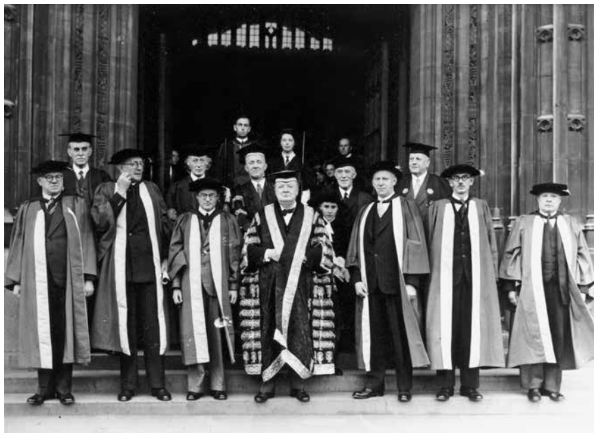
Figure 11. The Chancellor with leading figures from the universities of the British Empire and Commonwealth, having conferred honorary degrees on them, July 1948.

to you and their appreciation of all the trouble you took to come and meet and address them'. 12