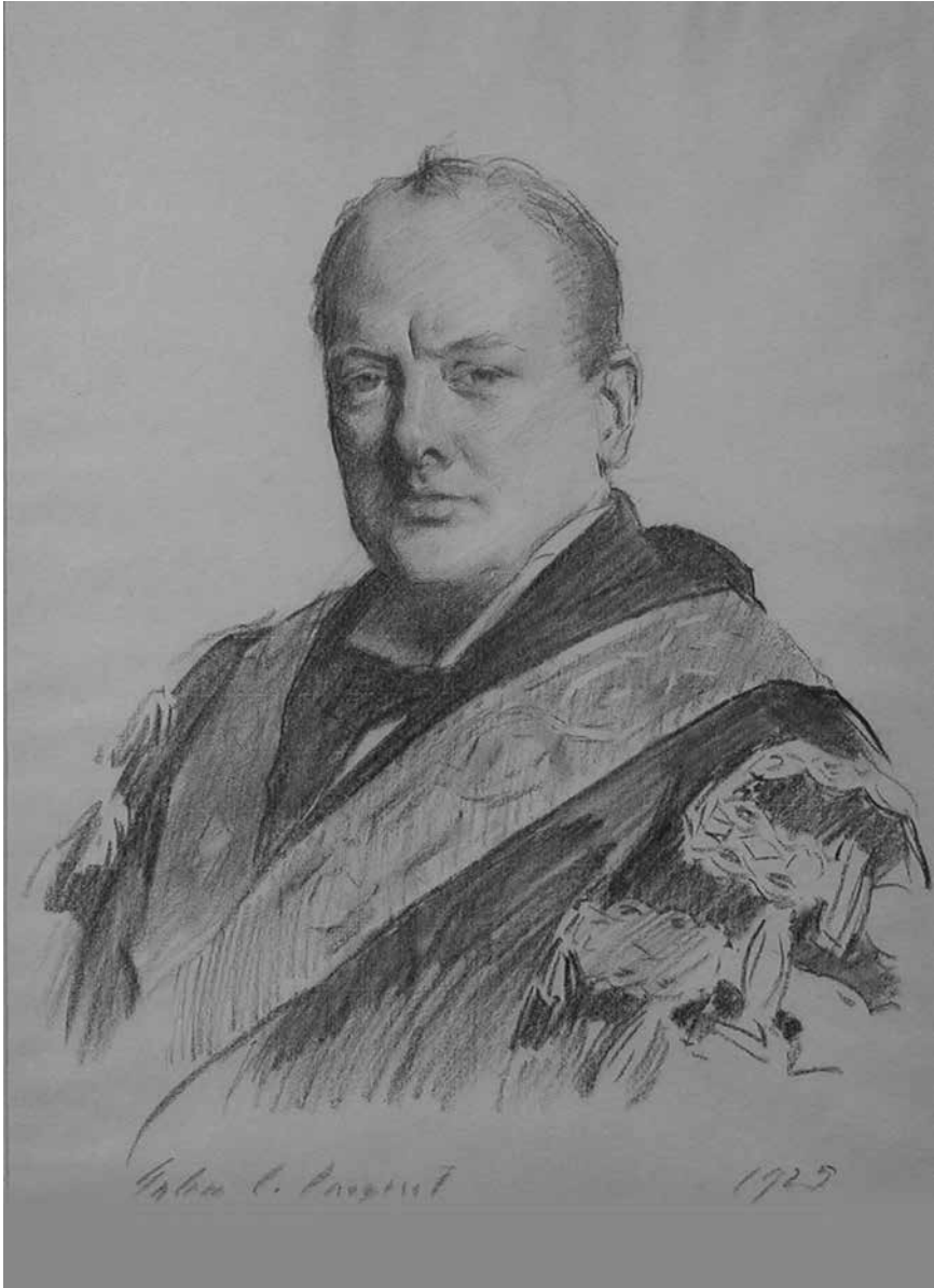
Figure 2. Churchill wearing his robes as Chancellor of the Exchequer, drawn by John Singer Sargent, c.1925.