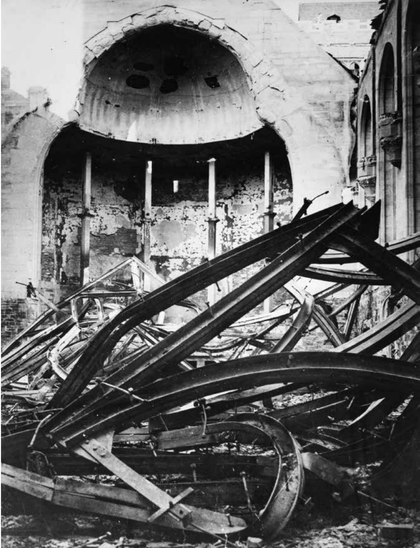
Figure 6. The Great Hall after bomb damage in December 1940.