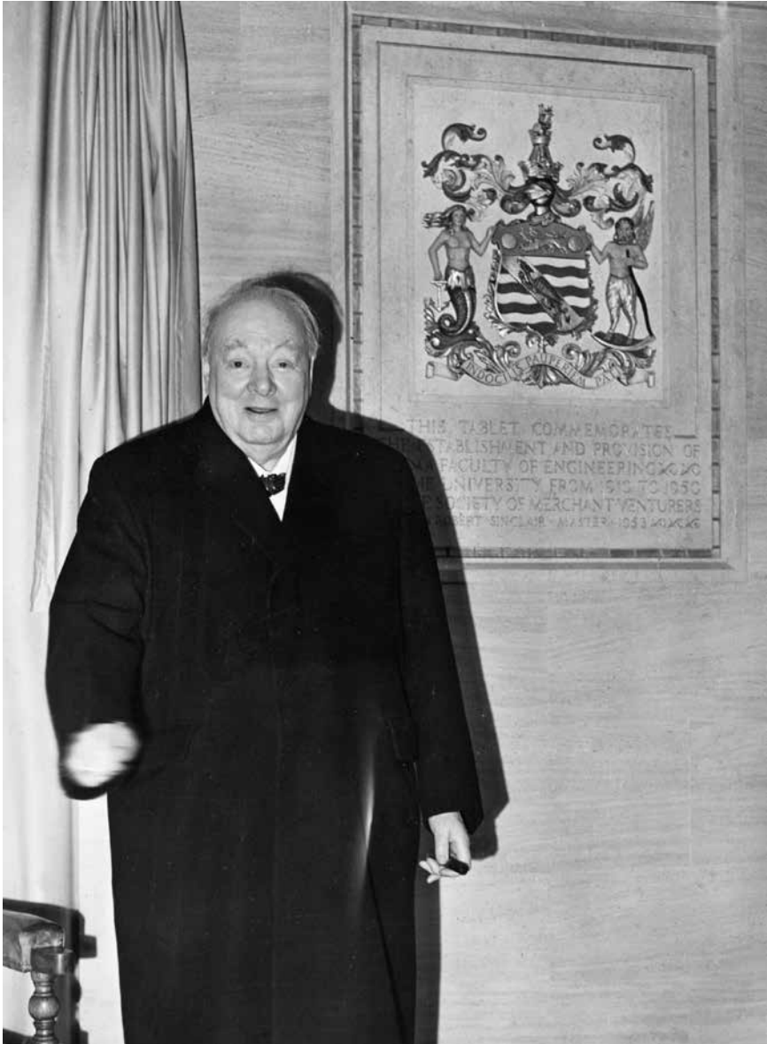
Figure 15. Churchill unveiling a plaque in the Queen's Building, November 1954.