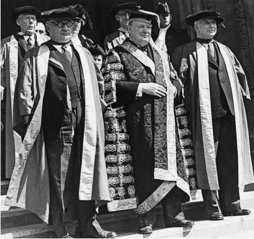
Figure 9. The Chancellor with Ernest Bevin and A. V. Alexander, having conferred honorary degrees on them, April 1945.

as Churchill made his triumphant way in the City's semi-state coach from Temple Meads Station to the Council House, accompanied by the Lord Mayor, the duke of Beaufort and the City Sword-bearer. 'In giving him the freedom of the city', the Western Daily Press opined, 'Bristol applauds the man of action and the great national leader who has done more than any one man to save not only his country but civilisation itself'. Having signed the roll of honorary freemen in the Council Chamber, where two hundred people had assembled, Churchill wished for 'a period of prosperity to refresh the strong life of the City'. 20 Later, at the University, he bestowed honorary degrees on Ernest Bevin and A. V. Alexander, the two men with strong local connections, but with very different party political affiliations from his own,