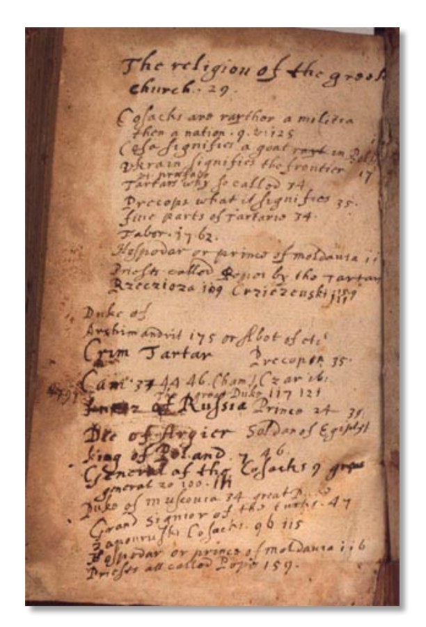
Pierre Chevalier, Discourse of the original, countrey, manners, government and religion of the Cossacks (London, 1672), classmark: [M.S. Anderson] 1672

ownership inscription from 1672 and a seventeenth-century manuscript partial list of contents at the back.