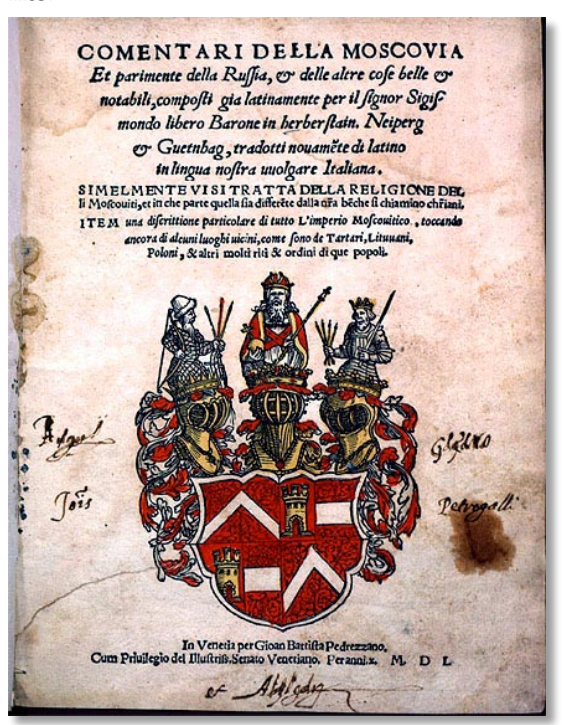
Sigmund von Herberstein, Comentari della Moscovia (Venice, 1550), classmark: [M.S. Anderson] 1550

Actual displays supplemented the first tentative web presence. The collector's widow suggested items for display when the collection came to Senate House Library, and this initial display functioned as a declaration of receipt - in a single case, the stage of rewiring and refurbishment in Senate House at the time having temporarily deprived us of a larger display area. The items shown exemplified the collection's variety, as a taster. Exhibits ranged from milestone works to pamphlets, from the sixteenth to the twentieth centuries. The most famous was the first Italian translation (1550) of Sigmund von Herberstein's famous Rerum moscoviticarum commentarii, a work which in numerous editions and translations formed impressions of Russia for several centuries.