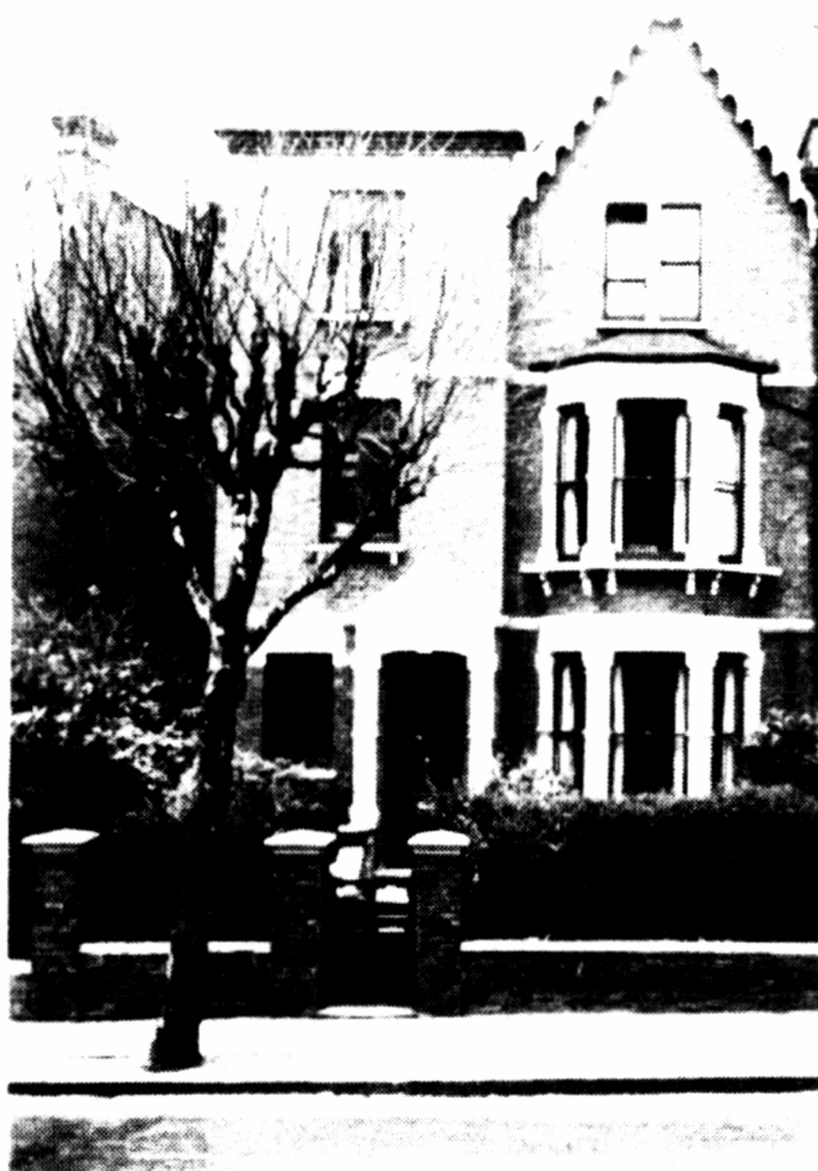
• Our London Home • • • 49 Parliament Hill, N.W.3