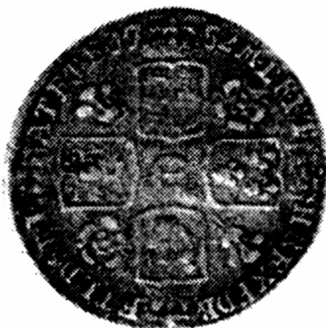
1732 Roses &amp; Plumes 6d.

Despite circulating coinage ceasing to use London Lead Company silver after 1737, it seems the Mint still relied on its high quality output for Maundy money. This was not issued every year but it is possible the London Lead Company silver was used to produce Maundy coins in maybe as many as the next 16-18 years of issue.