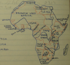
Map of Africa P310 P311-312

"Emp. Start around Coast (Circ. U.Y.O.F.S.) late all of Africa divided. Only 3. conts. S. B. part, France.