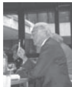
Lord Carrington and Dame Rosemary Spencer at the 'Rhodesia' seminar.

With The National Archives and the Centre for Cold War Studies, LSE, the CCBH organised a witness seminar on the Rhodesian question on 5 July 2005. It brought together surviving contemporary British participants in the process of independence, which culminated in the Lancaster House settlement of 1979 and Zimbabwe/Rhodesia's final attainment of internationally recognised independence in April 1980. The following participated: