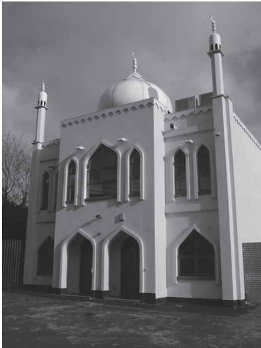
Mosque in Bristol, where 1001 years of ethnicity and identity are being studied.