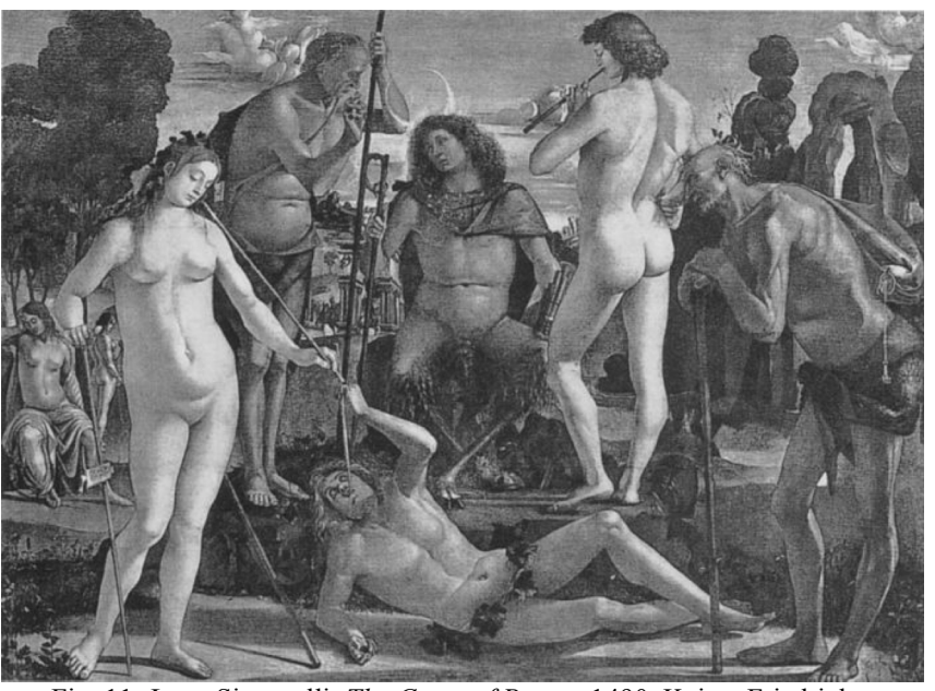
Fig. 11- Luca Signorelli, The Court of Pan , c. 1490, Kaiser Friedrich Museum, Berlin (destroyed 1945)

of a particular kind of shepherd that did not take care of his flock but mainly meditated and dedicated himself to music. The shepherd depicted without his flock, like the ones present in this painting, is therefore a higher type of shepherd, either one that belongs to the thiasos of Pan or one whose simple appearance is actually a disguise for an Olympic deity temporarily on Earth to seduce a young mortal maiden. The principal sources for this painting, as noted by Roger Fry, were most likely Macrobius's Saturnalia and Servius's commentary on Virgil Eclogues . Various figures are depicted in the painting, however Pan, is the only figure that we are able to identify with certainty.