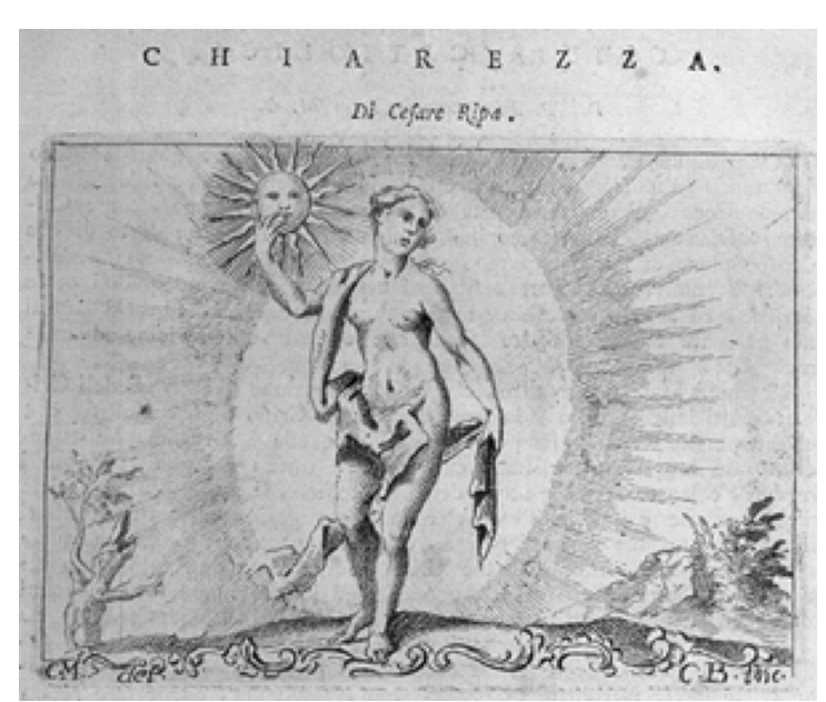
Fig. 17 – Cesare Ripa, Iconologia: Chiarezza, c. 1600

transparent dress symbolises how open and clear it as a science.<sup>184</sup> Chiarezza , or clarity, is described as a young naked woman who shines and holds the sun.<sup>185</sup> We find here a striking similarity with some depictions of Truth, as in the case of the image by Dürer previously mentioned. Then there is Readiness, Prontezza , a highly valued trait in the Renaissance, which is described as naked and winged as it signifies fast thinking and therefore must be free