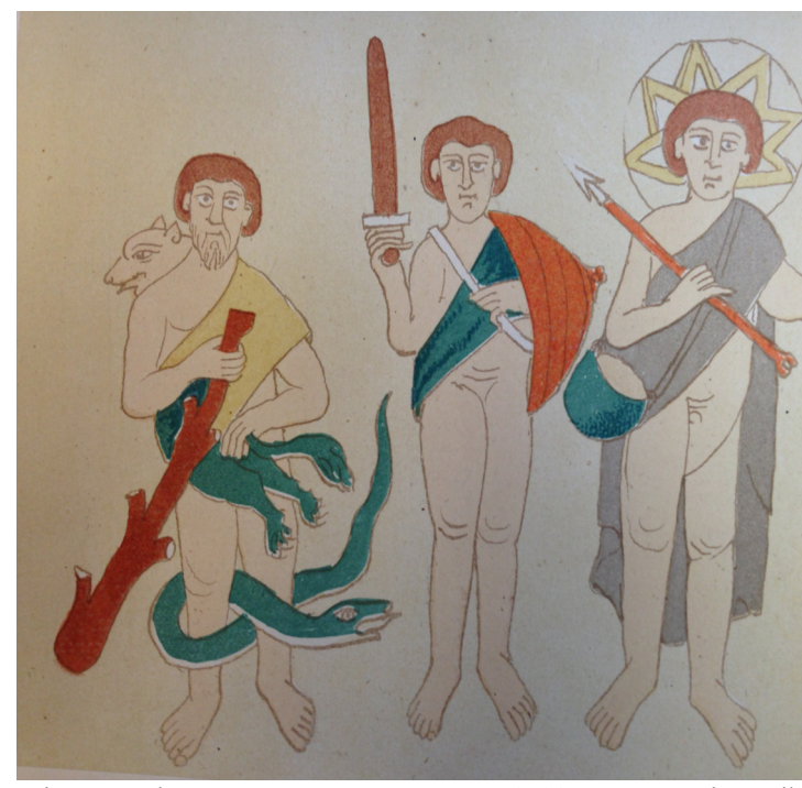
Fig. 5 – Rabanus Marurus, De Universo , 1023, Montecassino, Lib. XV. Cap. VI. – De diis gentium (Hercules, Mars, Apollo)

The medieval iconographic precedents for this type of representation are most likely the illuminations of Venetian the manuscripts of the Historia distructionis Troiae by Guido delle Colonne, dated around 1350-1370. Moreover Buchtal believes that these images are the earliest representations of this theme in medieval art. 98 Yet this is not the first time that goddesses such as Minerva and Juno are depicted naked in spite of their classical iconographic tradition. In fact, nakedness of the ancient gods extends throughout the Middle Ages, a very early witness of which is an illumination in De