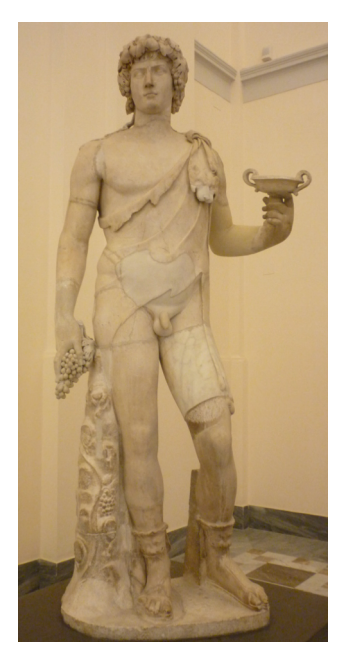
Fig. 9 – Antinous as Bacchus, Museo Archeologico Nazionale, Naples

woman has on her head a garland of vine, as drunkenness leads men to do unseemly things. Another entry in Ripa related to this same domain is Senso , or Sensation, that was described as a naked and fat young man because sensations he makes men go naked of the goods of the soul and the body, as when men think only about the present pleasures they do not worry about future calamities. 120