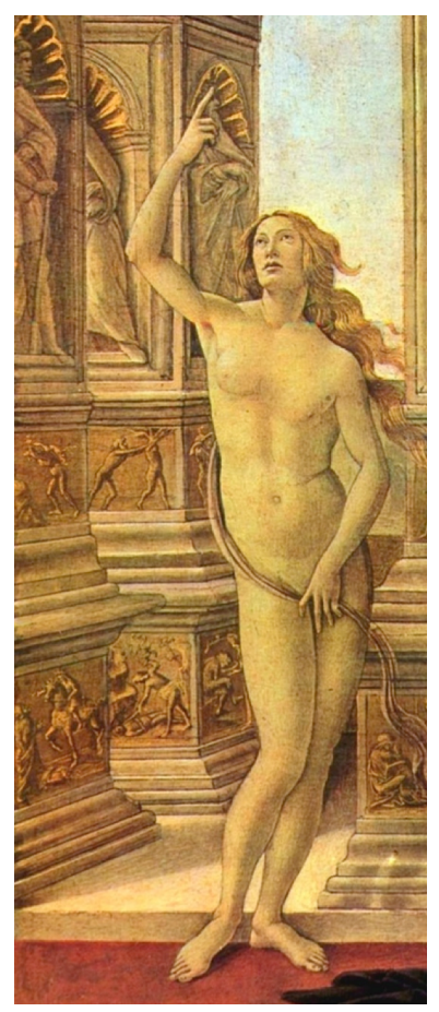
Fig. 14 – Botticelli, The Calumny of Apelles , Truth (detail)

On the far left of the composition a woman symbolising Truth, whose physical appearance recalls the description found in Alberti, is seen pointing and looking up at the sky. It should be noted, however, that the naked woman with long blond hair that represents Truth in Botticelli's painting is physically different from the other women usually painted by him. Unlike Venus, from the Birth of Venus, for example, the figure of Truth is much drier and elongated, with an almost androgynous body. The plump body and sensual curves that characterise the goddess of beauty and love are nowhere to be seen in this depiction of Truth. In my opinion it is a deliberate choice made by the painter to emphasize the symbolic significance of the figure. The nakedness of Venus, as we have seen, was usually used to underline her beauty and her close ties to the erotic world and thus she had to be depicted according to the beauty canons of the time, as described by Agnolo Firenzuola in his Dialogo sulla bellezza delle donne of 1452, in which the ideal