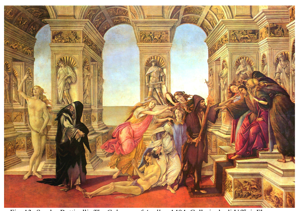
Fig. 13- Sandro Botticelli, The Calumny of Apelles, 1494, Galleria degli Uffizi, Florence

Truth in Apelles' allegory embodies the perfect human actions and thoughts. Other examples of the classical comprehension of Truth, and naked Truth, can be found in Euripides and Seneca. Truth the Renaissance, Truth was described in many different ways, and had different meanings. Ficino described it as both the food of the soul and the substance the soul is made of, and Giordano Bruno saw it being as incorporeal. Sometimes, in giving a visual representation to Truth, Christian iconography would be used, as in the case of Dürer where Truth holds the sol iustitiae . More often however, she is depicted in the nude, becoming simultaneously an image of vulnerability, openness and moral perfection. Her nudity came to be understood as a symbol of truth in a general philosophical sense. Truth was therefore interpreted as an expression of inherent beauty as opposed to mere accessory charms. Furthermore with the rise of the Neo-Platonic movement, it came to signify the idealised domain and the intelligible as opposed to the physical and sensible world. The figure of the nuda veritas became one of the most popular allegories of the Renaissance; a very good example of its visual representation is in Botticelli's allegorical painting The Calumny of Apelles .