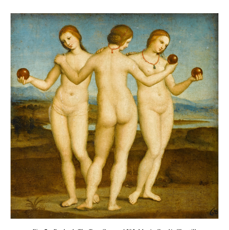
Fig. 7 – Raphael, The Tree Graces , 1505, Musée Condé, Chantilly

Antiquity; and in fact both Seneca<sup>114</sup> and Horace<sup>115</sup> described them as dressed. In Renaissance iconography the Graces are characterised by nudity, as in the case of the Three Graces by Raphael, or with transparent clothes as in the case of Botticelli's Primavera. The work by Raphael was inspired by the Hellenistic group depicting the Three Graces, known by various copies of Roman and other reproductions via fresco. 116