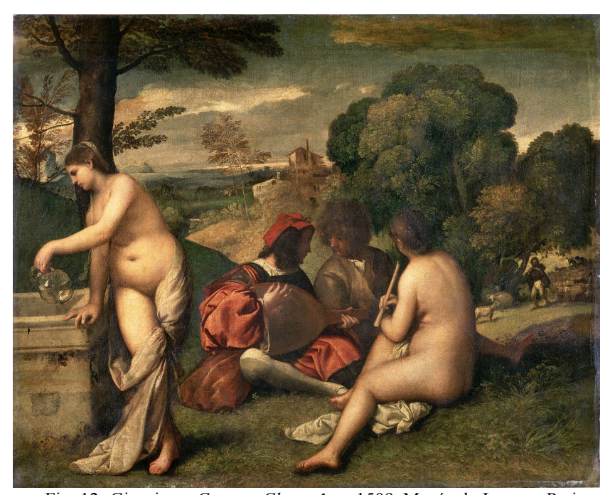
Fig. 12- Giorgione, Concert Champêtre, 1509, Musée du Louvre, Paris

Another painting that reflects the other interpretation of Arcadia is the famous Concert champêtre by Giorgione. The painting shows in the foreground a group of two clothed men sitting on the ground playing music as well as two naked women. The atmosphere is of serene tranquillity yet tinted with wantonness because of the nakedness of the women. In the distance, a lonely shepherd is taking care of his flock. It is possible to distinguish between the two kinds of shepherds that we also find discussed in the aforementioned Neo-Platonic circles. In this case we have the typical shepherd in the background, which is juxtaposed to the two men playing music, which embody the second type of the 'pastoral' life.