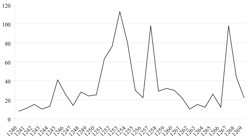
Fig. 2. Grants of markets and fairs between 1240 and 1269

the mid-thirteenth century (see Fig. 2). In the political climate of the royal court and political situation at that time – such as the expedition to Gascony, and the Baron’s War – the grant of markets and fairs became a significant patronage tool for Henry III and a source of income from the payment in gold from the recipients. An investigation of the unpublished Fine Rolls in The National Archives reveals that the number of payments fluctuated significantly in the 1250s. The results of this part of the project were presented by Dr Jamroziak at the Leeds Congress in July. Another paper on this subject will be given at the ‘Thirteenth Century Conference’ in Durham in the early September 2003. It will also result in the publication of two articles, one of them in the proceedings of the Durham conference.