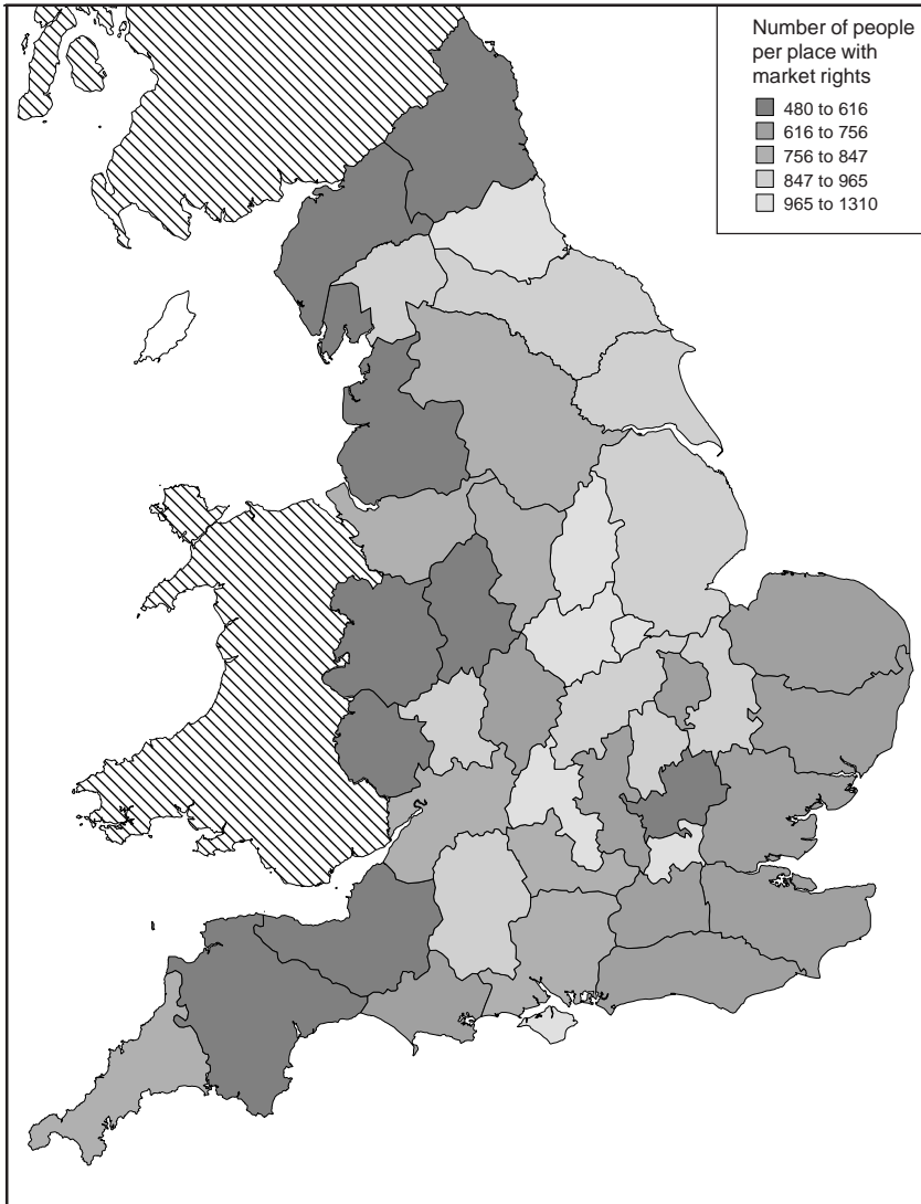
Fig. 1. Density of places with market rights in relation to population in England in 1377