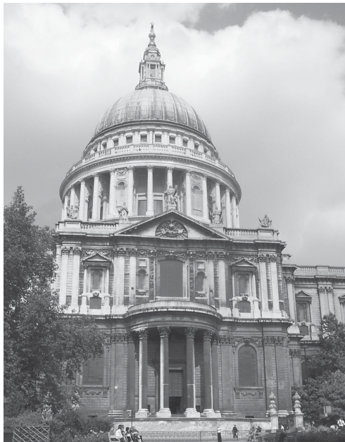
Fig. 4. St Paul's Cathedral from the south

We are still on track (just!) for publication of the history on the feast of St Mellitus (24 April), the first bishop of London since Roman times, in the 1,400th