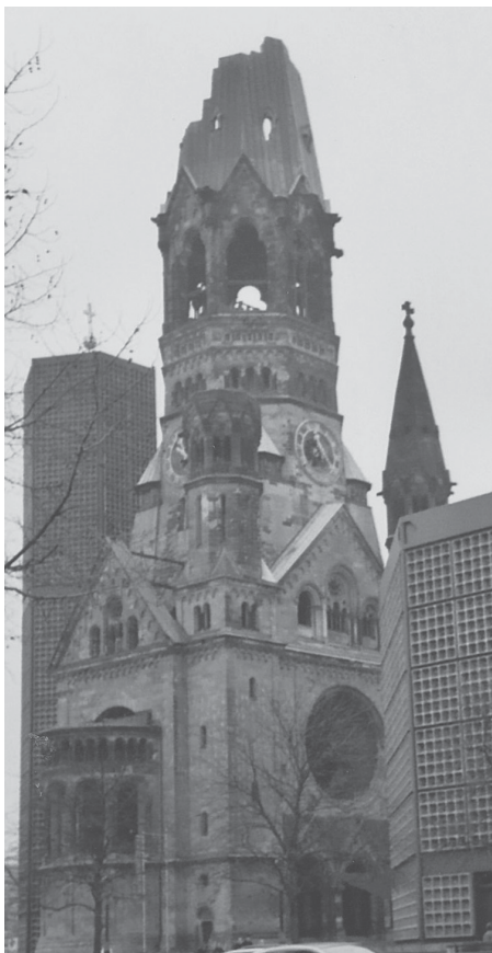
Fig. 5. Kaiser Wilhelm Memorial Church, Berlin

networks. In London, the most widely commemorated disaster is the Great Fire rather than the Blitz. St Paul's Cathedral, devastated in the Great Fire and rebuilt after 1666, was a symbol of national resistance during the Second World War. Despite (or perhaps because of) its wartime significance, the cathedral never became a focal point of war remembrance in London.